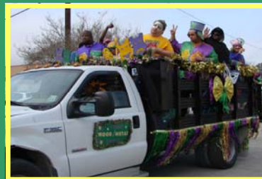
Wood & Metal enjoy riding in the TARC parade