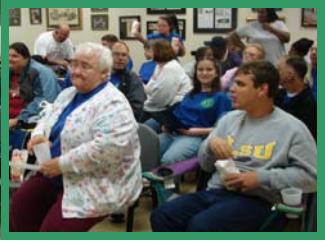
Members are ready for the movie night to begin.