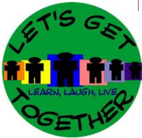
The Let's Get Together Club logo.